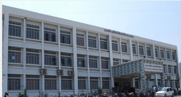
Academic and Administrative Building

Institute is spread over 19.38 acres of land in the heart of Jalgaon city. All departments possess well equipped laboratories and classrooms to provide great learning ambiance. Boys' and girls' hostels, officers and staff residential facilities are available on campus. The institute has an AC seminar hall to organize institute level programs such as Seminar, workshop, T&P activities etc.