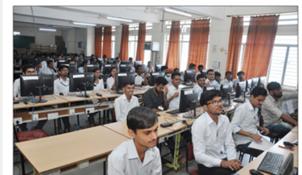
Central Computing Laboratory